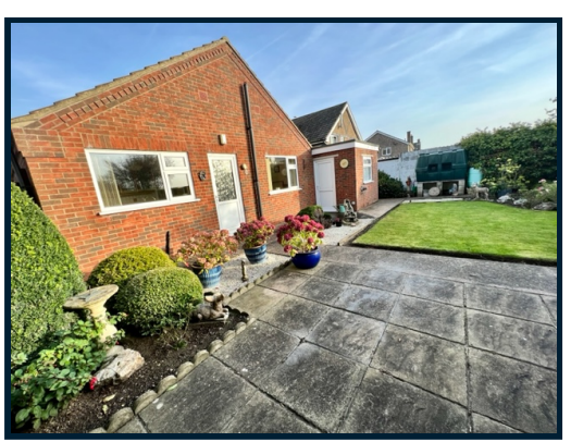
Terraine Jubilee Road North Somercotes Louth LN117LH