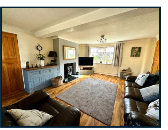
The Cottage Buttgate Grainthorpe Louth LN11 7HR